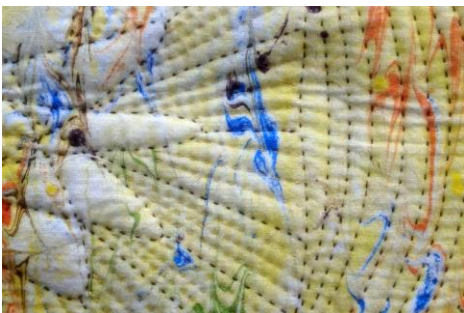
Detail image of artwork

This piece is designed to be displayed in a horizontal or vertical orientation. These experimental pieces are smaller and will be spectacular paired up with several of the other pieces for a collage-type display.