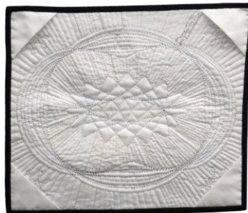
View of back of artwork